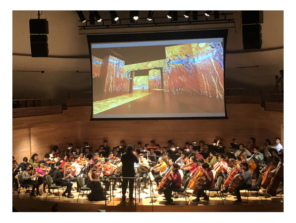
The Jalapa Youth Orchestra in the smaller concert hall at the 'Tlaqná Center'