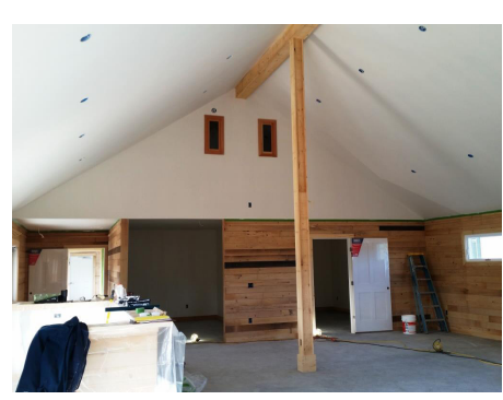
Interior of the new Hancock Historical Society Building